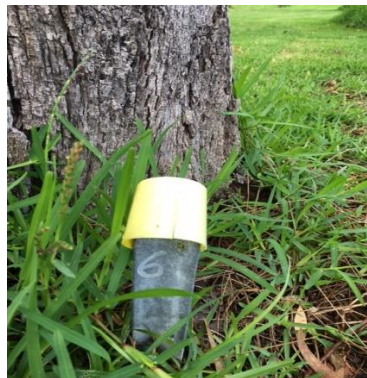
Figure 3 – Example of subsidence monitoring point with safety cap

Established and proposed (subject to access restrictions) survey monitoring points will be monitored around the southern and northern foreshore areas about the extraction plan area. These will consist of either star pickets, feno pegs or survey pins ( Figure 3 ). The marks will be monitored as per the Subsidence Monitoring Program. These routine surveys prior, during and after extraction will allow for the identification and review of any subsidence starting to develop outside predicted levels and thus trigger a review of any potentially new public safety concerns. NPWS approved a Conservation Risk Assessment in 6 November 2019 to allow the installation of the Miniwall S4 and S5 survey markers on the Lake Macquarie foreshore within the State Conservation area. During the routine foreshore monitoring, observations and records for change will be noted as outlined in the Subsidence Monitoring Program. This will include observations for surface cracking, embankment movement, cracking, and validation of impacts to drainage or dwellings in areas of measured subsidence increase outside predicted.